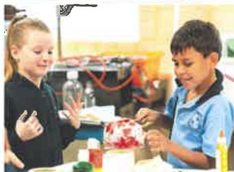
Creative Schools Program 2021, Camboon PS.